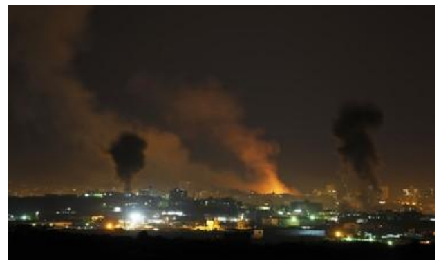
Iranian made Hamas rockets hit the ancient biblical town of Ashkelon on Friday.