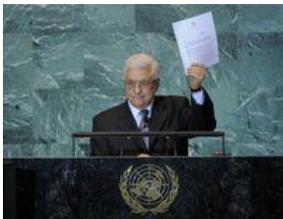
Abbas appealing for Palestinian Statehood at UN

The nations of our day are playing right along with the devil's plan to form a global government and global religion. (Revelation 17 & 18) The United Nations, who have shown themselves to be consistent adversaries of Israel, have recently granted recognition of statehood to Palestine. Here is a portion of a well written overview of this recent vote from the Seattle Times :