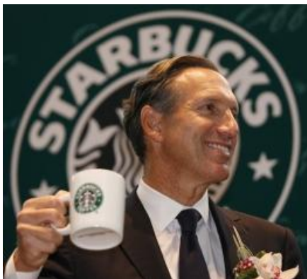
Starbucks Chief Executive Howard Schultz tastes a cup of coffee as he attends a ceremony marking the 10th anniversary of the opening of the first Hong Kong Starbucks in Hong Kong. Starbucks sees the potential for thousands of stores in Greater China, where it currently has around 700, and is also keen on expanding in India and Vietnam, the head of the world's largest coffee retailer said. April 15, 2010