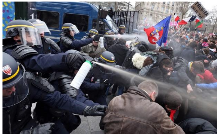
Police in Paris used tear gas to disperse hundreds of thousands of protesters demonstrating against gay marriage on the Champs-Élysées.

Again, we find the consistent confirmation of God's intention in the marriage union in the inspired writings of the Apostle Paul. For church leaders he declared through the leading of the Holy Spirit, God's intent for church leaders, as well as church male church members, if they are married, to be the "husbands of one wife" (1 Timothy 3:2, 3:12; Titus 1:6) . In reference to the church's ministry to widows, among the policies that verified their true qualifications for assistance and participation in special ministry in the church was that they were to be the "wife of one man" (1 Timothy 5:9) . The design of marriage was given to form the family as a society in miniature . The family is a building block for a great and stable national culture. It begins with marriage between a man and a woman to commit