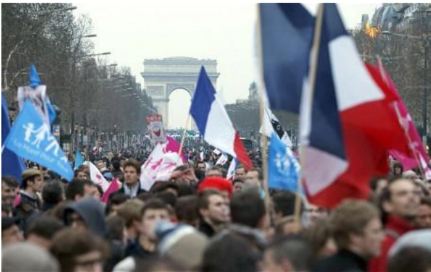
The demonstrators lined a three-mile route from the Paris business district of La Defense to the roundabout where the Arc de Triomphe is located.

Idolatry and homosexuality are intrinsically tied together in the Word of God. In Romans 1, Paul explains how the result of denying God is idolatry and ultimately the sin of homosexuality arises. This is what is happening in America today. There is no way to explain away this connection without somehow twisting the plain intention of the text. Alternate interpretations have often been attempted by those who wish to legitimize homosexuality apart from the Bible's clear teaching. For the purpose of clarity I will quote the entire passage in Romans 1 relative to this issue. This is a section of Scripture that all Christians should get familiar with in these last days in order to better defend faith and marriage during this time when these are under such grievous Satanic attack!