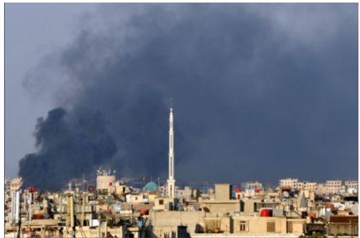
Damascus-Syria after Israeli Strike

I believe we are seeing events preceding and preparing the world for the fulfillment of these Divine predictions occurring at this time. Are you a believer in Jesus Christ as your personal Savior? In Matthew 24:33, Jesus said about these very times: “So likewise ye, when ye shall see all these things, know that it is near, even at the doors.” Trust in Jesus Christ as your personal Savior by asking Him to save you today and to forgive you of your sins through His dying for you on the cross and rising from the dead. The Bible promises that: “But as many as received him, to them gave he power to become the sons of God, even to them that believe on his name” (John 1:12). (Posted on May 6, 2013 by prophecyinperspective.com )