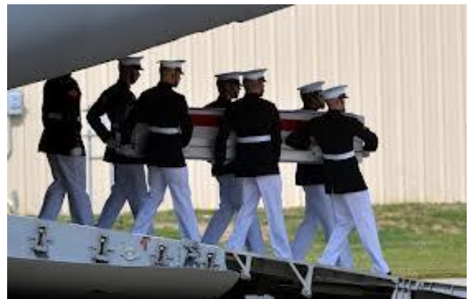
Victims of Benghazi Terrorist Attack Brought Home

When we look at the many events of our day, such as the Nazi-like abortion doctor in Philadelphia murdering children after they are born, political cover-ups such as "Fast and Furious" and Benghazi, a man in Ohio who kidnapped and imprisoned three woman and a girl for ten years, a young woman convicted of brutally murdering her boy friend, a sudden terrorist bombing in Boston, and more, we should be aware that the Lord's coming grows near. Christians need to be aware of Bible prophecy so that they are not surprised at the present day intrigues, cover-ups, evil perversions of immorality, rising crime rates, confusion among nations, earthquakes, and pestilences. These troubles all