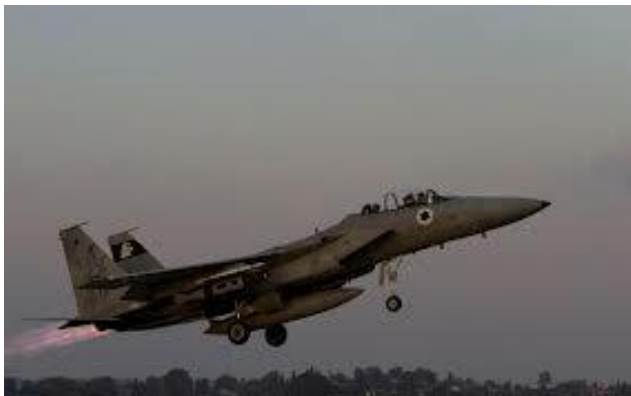
Israeli jet preparing to attack Damascus-Syria

Several things work to Israel's advantage through these recent attacks against Syria. In attacking Damascus, Israel is showing President Obama that they will take action to defend themselves even if he will not help them. They are also indicating to Iran that Israel will be pushed for only so long. They may be planning an attack on Iran's nuclear sites which could come at any time. While Iran and President Obama would be dumbfounded at their audacity, Israel will have further amazed their enemies at just how well they are able to