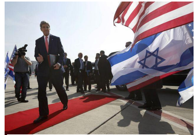
U.S. Secretary of State John Kerry walks to his plane after meeting with Israeli Prime Minister Benjamin Netanyahu in Tel Aviv, Israel (Washington Times, 11-8-2013)

have warned the world as to their clear intentions. But their present intentions , through a change of leadership are to fool undiscerning governments, such as our current leadership in the U.S., into believing that Iran has changed their policies . Recent peace negotiations between the U.S. and Iran have shown how easily we are taken in by Iran's diplomatic subtleties. "On Point," with Tom Ashbrook, November 14, 2013, says about these negotiations: "Israel has blasted the negotiations with Israeli Prime Minister Benjamin Netanyahu saying they are headed for 'a very dangerous and bad deal,' and 'the deal of the century' for Iran." This confusion through diplomatic deception is now lulling America into a greater attitude of complacency which is making Israel all the more insecure and vulnerable to their enemies. This is another reason why we are seeing such great confusion in our land these days! (Exodus 14:24; Deuteronomy 7:23; 1 Samuel 5:11)