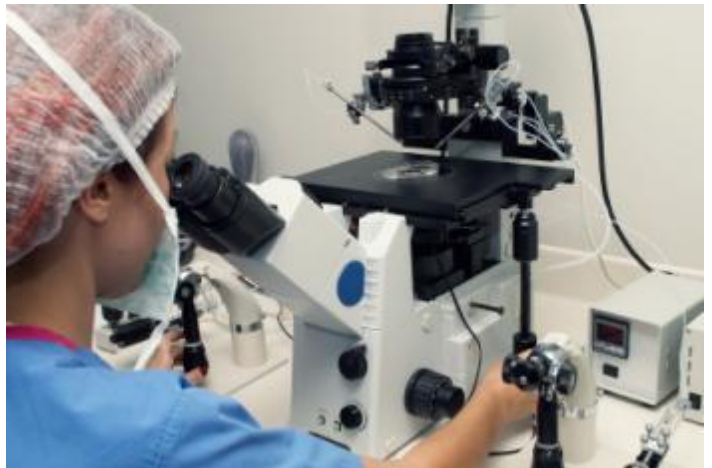
The Ebola virus kills 9 out of 10 people it infects, and there is no treatment or vaccine

As a further indication of the Lord's imminent return, it is intriguing how many earthquakes there have been around the world in recent days. On April 18, there were reports of a 7.2 earthquake in Mexico City, also, there was a quake in Los Angeles, California, and Tokyo experienced a 4.7 earthquake recently. Also a 5.1 quake hit southern Iran. A small quake, a 2.7, hit Mount Vernon, Ill. Also, a strong earthquake struck off the Solomon Islands. A 6.0-magnitude quake was recorded in recent weeks at 6:13 p.m. Hawaii time 76 miles west-southwest of Lata, Solomon Islands at a depth of 6.2 miles, according to the U.S. Geological Survey." More earthquakes have been reported yesterday, May 9 in Chile, near Santa Cruz, an earthquake of magnitude 5 struck southern Pakistan injuring 70 and killing one. Also, the same day, the Philippines experienced an earthquake just off the coast. ( Rapture Ready News ) Reports of new diseases are also on the rise. For example, a new strain of the Ebola virus has been reported in Guinea and is already taking lives. The Ebola "is a virus that kills 9 out of 10 people it infects, and for which there is no treatment or vaccine, meaning the only way to stop it spreading is through prevention." ( Medical News Today , April 2, 2014)