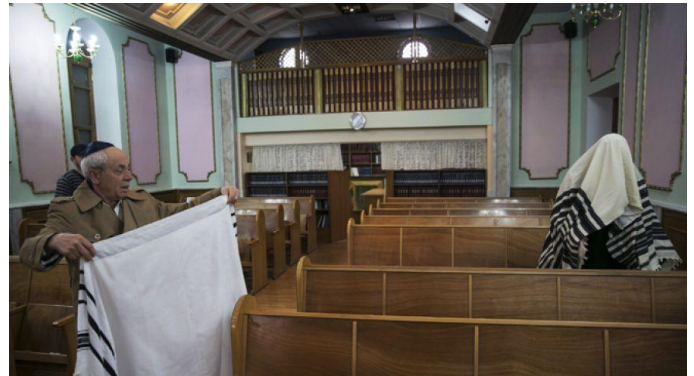
Jewish men at a synagogue in Donetsk, Eastern Ukraine.

This supernatural deliverance of Israel from their enemies has been repeated many times over the centuries. While many cruelties have been perpetrated upon the Jews throughout history, as for example through the Nazis of World War II, yet God has preserved His people supernaturally. Remember how, out of the atrocities of the German death camps, God re-established Israel once again as a Nation in 1948. Many Jews are back in their land, once again speaking Hebrew, and many of them are watching for the Messiah!