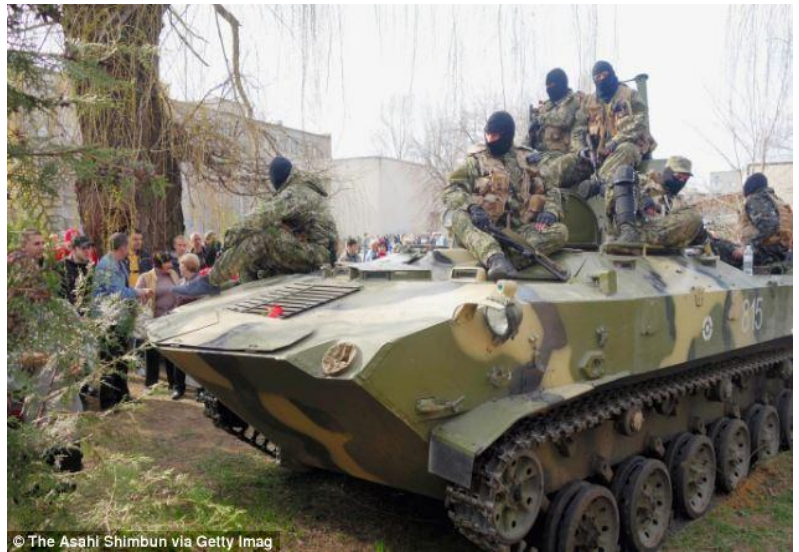
Pro-Russian soldiers on a tank in eastern Ukraine where leaflets ordering Jews to register has added to tensions

"We experienced years of starvation and wars, and in all of those years I haven't heard so much talk about making aliyah [moving to Israel] as I do now," he said.