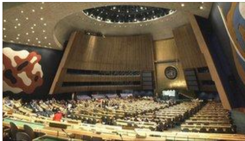
Palestinians believe over two-thirds of the General Assembly would recognize their statehood.

The 15-member UN Security Council needs to recommend statehood to the General Assembly. If it does, then a vote on membership by its 192 members could take place on 20 September. Approval requires a two-thirds majority- or 128 votes. Currently 116 countries are said to recognize Palestine but the Palestinians hope they would gain the support of up to 150.